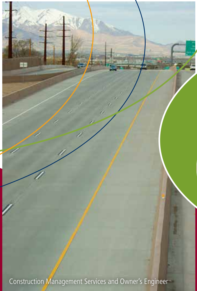
Construction Management Services and Owner's Engineer