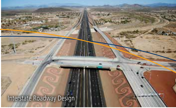
Interstate Roadway Design