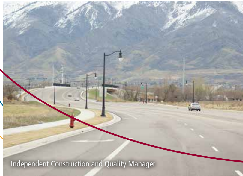
Independent Construction and Quality Manager