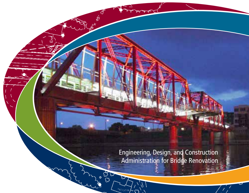
Engineering, Design, and Construction Administration for Bridge Renovation