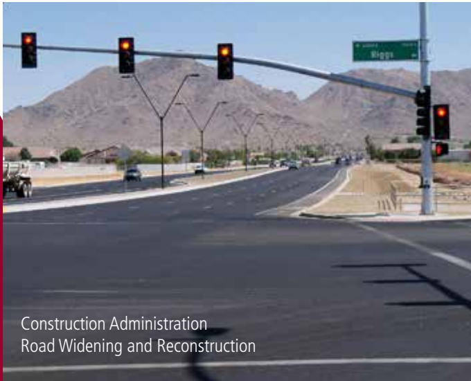
Construction Administration Road Widening and Reconstruction