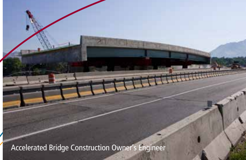
Accelerated Bridge Construction Owner's Engineer