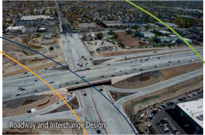
Roadway and Interchange Design