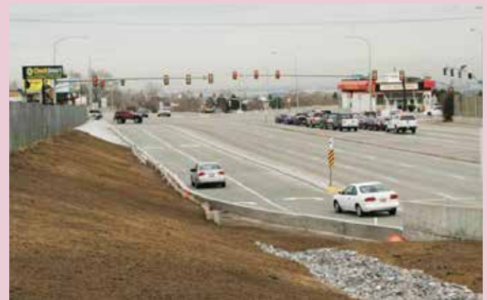
Innovative Intersection Solutions (CFI)