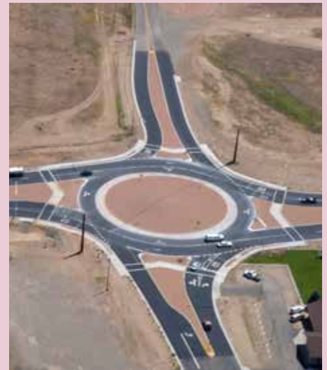
Roundabout Design and Construction