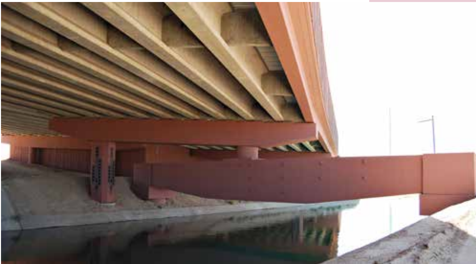
Innovative Structural Solutions