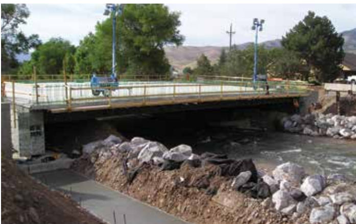
Design for Accelerated Bridge Construction